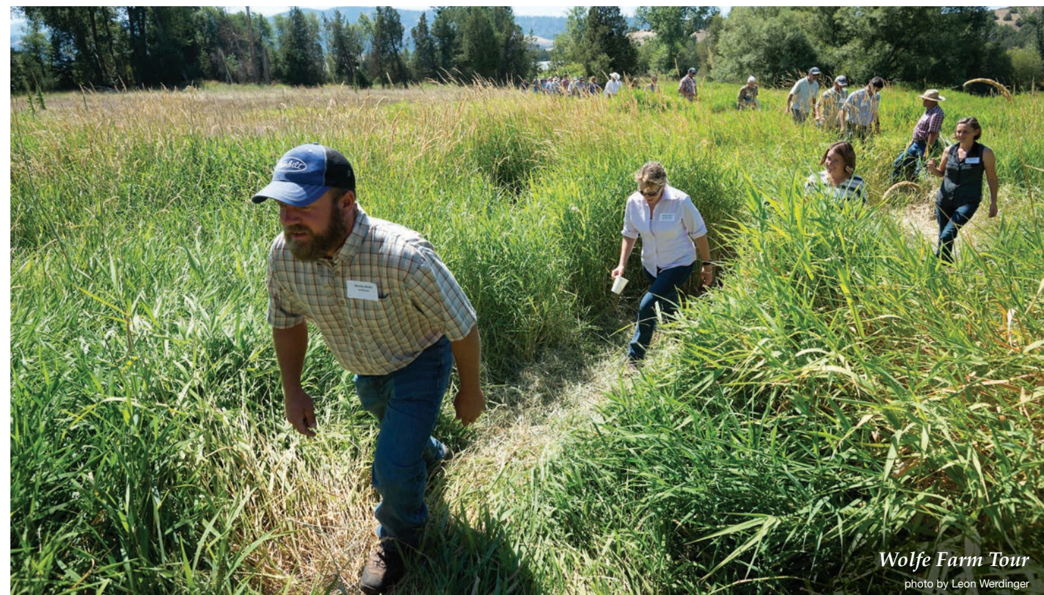
Wolfe Farm Tour