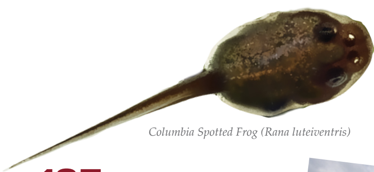
Columbia Spotted Frog ( Rana luteiventris )

229 Columbia spotted frog egg masses found on the Wolfe Farm